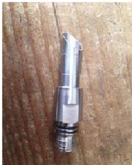
Filter Screen Figure-02